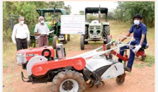
College Assessment - Tamil Nadu

The courses covered are from various segments such as Livestock Production and Management, Farm mechanization, Sustainable Agriculture, Green House Management, Fisheries & Aquaculture, Soil Sciences, Organic Farming, Sericulture, Tea Plantation, etc.