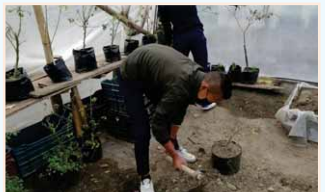
School Assessment - Sikkim

Under Samagra Shiksha, various states are running Agriculture QPs from 9 th to 12 th class. Since Jan'2021, more than 14,000 candidates have been assessed in 9 States i.e. Jammu & Kashmir, Sikkim, Punjab, Mizoram, Andaman & Nicobar, Himachal Pradesh, Haryana, Jharkhand and Uttarakhand. The courses covered were Paddy Farmer, Solanaceous Crop Cultivator, Dairy Worker, Small Poultry Farmer, Gardener and Floriculturist (Open Cultivation).