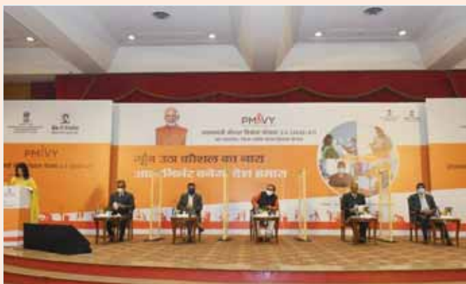
PMKVY 3.0 Launch

National Skill Development Corporation approved 36 Agricultural job roles for the third phase of the scheme where State Skill Development Missions and District Skill Committees can select based on the demand and suitability of Districts.