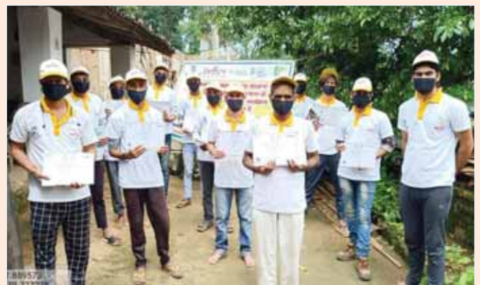
Distribution of Organic Grower Certificate