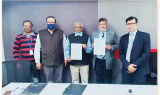
Signing of MoU with NCML

Foundation for Ecological Security and Ornamental Fisheries Training and Research Institute, a Udaipur based organization, has been on boarded for the conduct of a 'Fee Based' RPL programme in the Job Role of 'Ornamental Fish Technician'.