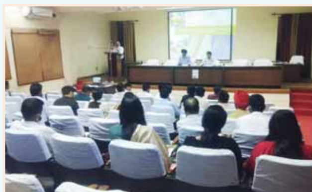
Meeting with Horticulture Department, Haryana