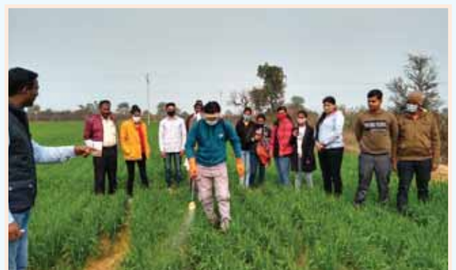
Quality Seed Grower, KVK Jhansi

The popular job roles include Organic Farming, Dairy Farmer/ Entrepreneurship, Aquaculture Fish Farming, Mushroom cultivation, Vermicompost Producer, Quality Seed Grower, Small Poultry Farmer, Beekeeping, etc.