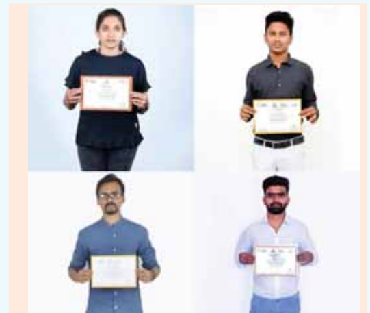
USA Placements: 4 candidates employed in Poultry

Between Jan - Jun' 2021, ASCI has generated 324 apprenticeship contracts. Till date, 13 Model Curricula have been approved and uploaded on NAPS portal. There has been a surge in demand for appointing apprentice under different Agriculture trades like Agriculture Field Officer, Gardener and Pesticide and Fertilizer Applicator are in demand by agricultural industries and organizations.