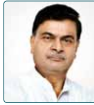
Dr. Mahendra Nath Pandey Hon’ble Minister, Ministry of Skill Development & Entrepreneurship (MSDE)

“ We have seen great potential, great energy & enthusiasm in the youth of the country & how they are adapting to new age skills, transforming their lives & contributing to the new India. If the program has been able to transform lives, it is because of the passion & grit with which the youth is participating in it. We are working closely with the States, Department and Industry to ensure a robust skill ecosystem which would empower the youth and create opportunities of employment for them”