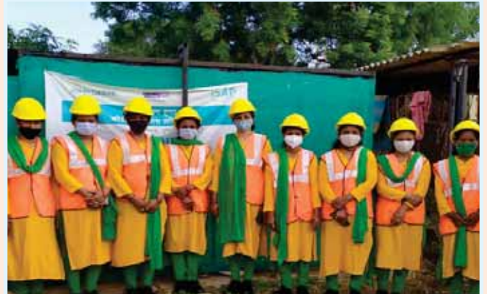
CSR - Tractor Mechanic