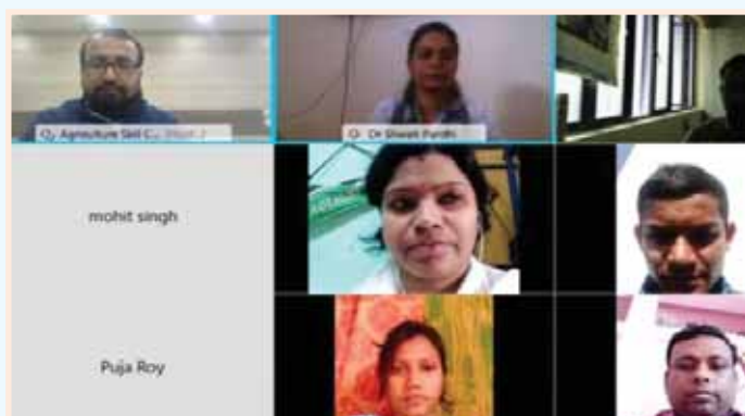
TOT conducted on 18 th Feb' 2021