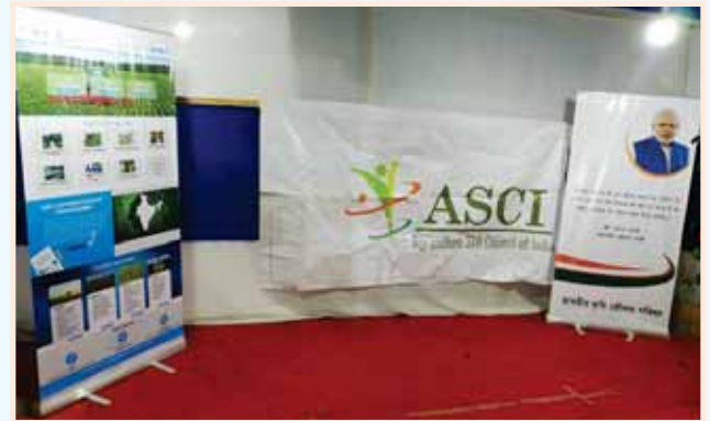
Livestock and Poultry show, Guwahati