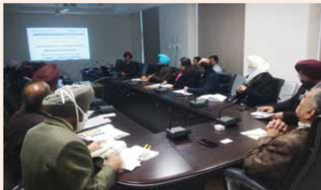
Dairy & Animal Husbandry Meeting, Mohali